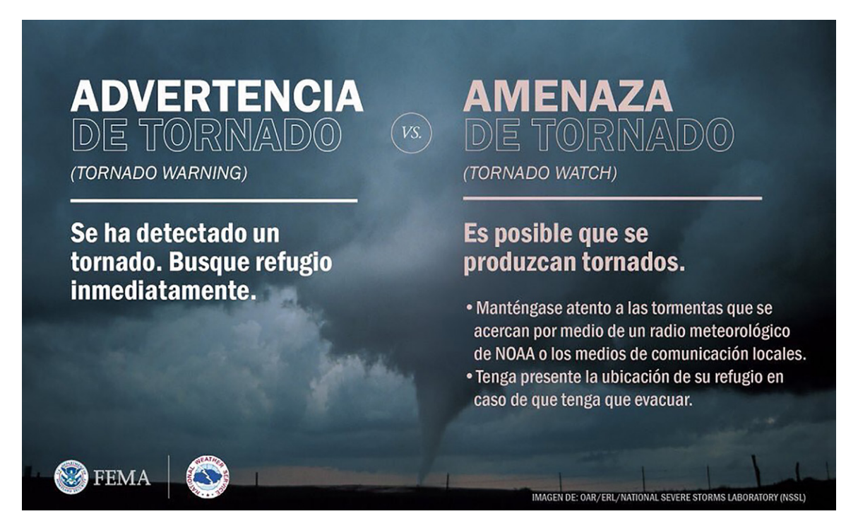
Fig. 2. Graphics that FEMA uses in their Spanish social media channels (www.ready.gov/collection/ severe-weather).

throughout the United States have also used different versions of these words when translating them from English to Spanish, including alerta for "warning" and amenaza for "watch." Two issues emerge from these inconsistencies. First, government agencies are creating confusion, using some translations interchangeably for "watch" and "warning." Second, due to their